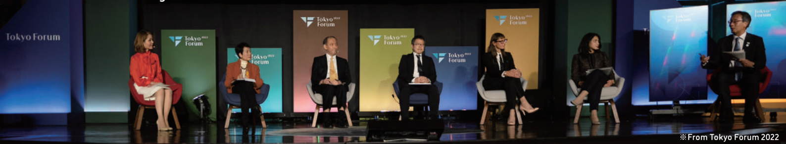
※ From Tokyo Forum 2022

Tokyo Forum is an international conference series that the University of Tokyo created together with the Chey Institute for Advanced Studies of South Korea in 2019, and has provided a meeting place of people, including, but not limited to, those in academia, government, business, NPOs, from all over the world. This year's forum will bring together the expertise of both technological sciences and social sciences, to explore how humanity can respond to the global problems we face today amid social divisions and digital transformation.