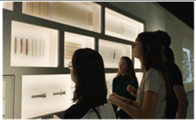
Tour of the exhibition hall