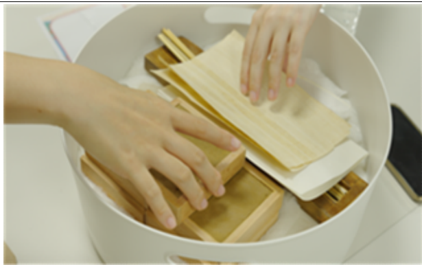
Recording letters tool experience